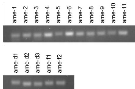
Fig. 2. Expression confirmation of novel miRNAs identified by cloning from foragers using stem-loop RT PCR.

ame-miR-210, ame-miR-282 and ame-miR-34 was over 2 (2.3-fold, 2.2-fold, 2.1-fold and 2.1-fold respectively). Ame-miR-iab-4, 133,13b, 2, 277, 317, 10, 92a, 124, 87, 14, 252, 33, 125, 929,276, 137,100, 190, 316, 1000, 927, 932, 7, 263b, 219, 981 and ame-ban-tam had a fold-change (absolute values) greater than 1 and less than 2.